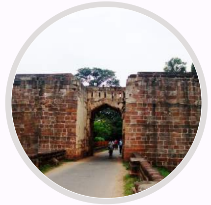
BARABATI FORT, CUTTACK