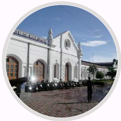
ODISHA MARITIME MUSEUM, CUTTACK