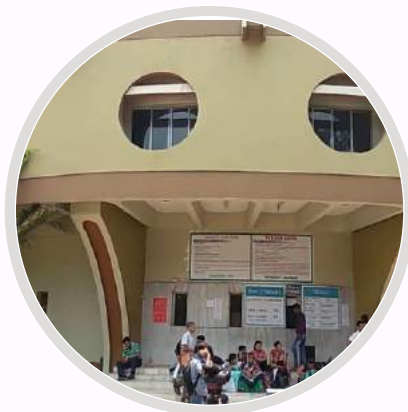
PATHANI SAMANTA PLANETARIUM