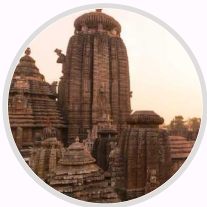
LINGARAJ TEMPLE BHUBANESWAR