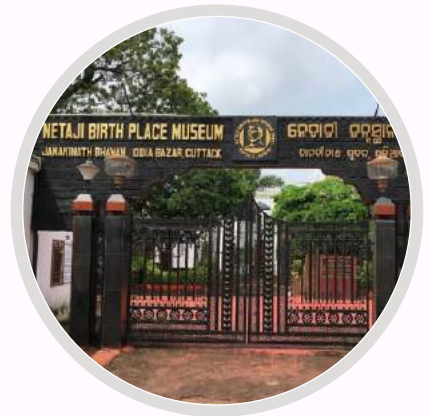
NETAJI BIRTH PLACE MUSEUM, CUTTACK