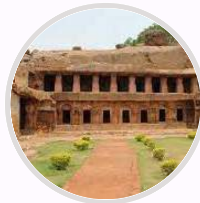
KHANDAGIRI / UDAYGIRI CAVES