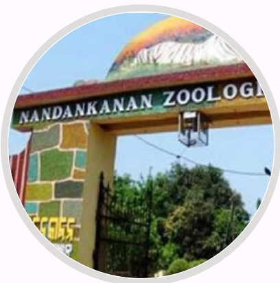
NANDANKANAN ZOOLOGICAL PARK