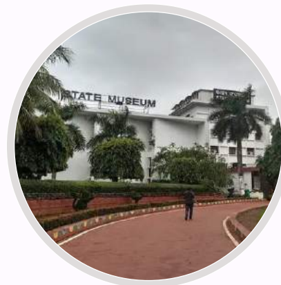
STATE MUSEUM, BHUBANESWAR