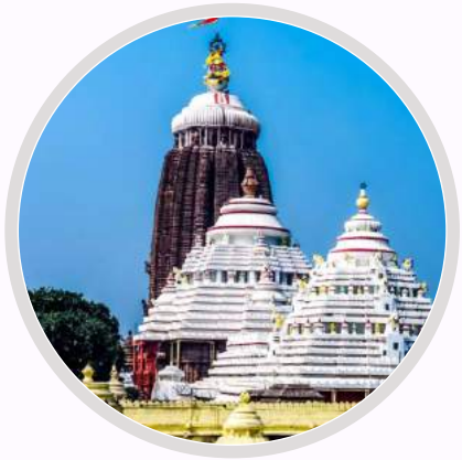
JAGANNATH TEMPLE, PURI