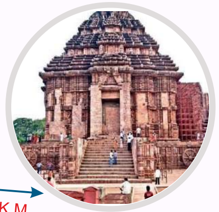
SUN TEMPLE, KONARK