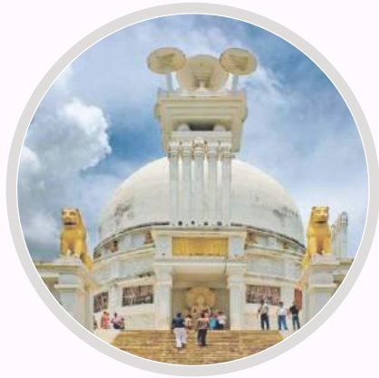
DHAULI SHANTI STUPA