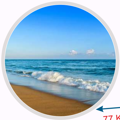
SEA BEACH, PURI