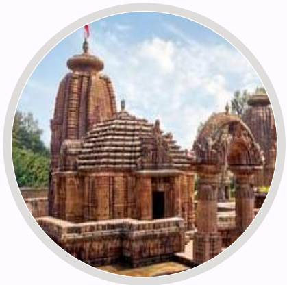
KEDAR GOURI TEMPLE, BHUBANESWAR